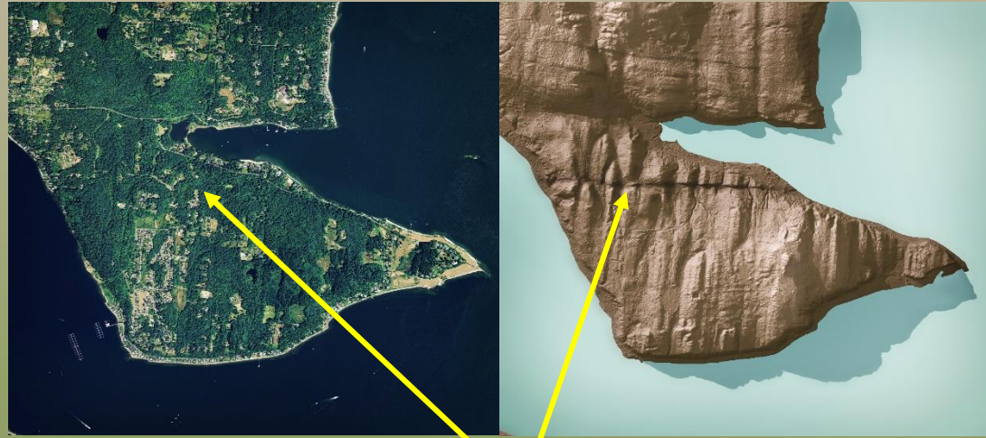
Seattle fault, Bainbridge Island

DNR has embarked on an ambitious program of mapping geologic hazards by acquiring high resolution, high accuracy digital topographic data, called lidar. Our geologists and others can use these new data to map landslides and faults that threaten Washington's infrastructure